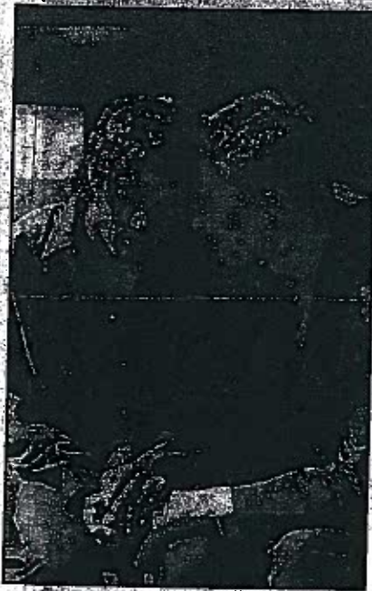
Comfort... Double Tongue from Border Crossings